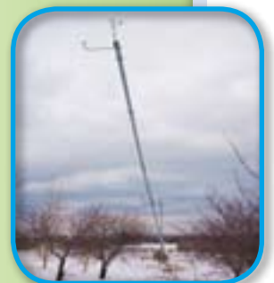
Meteorological tower installation in Mason county.

Consumers Energy recently began constructing meteorological towers in Mason and Tuscola counties, where it has secured more than 28,000 acres of easements to develop wind generation farms.