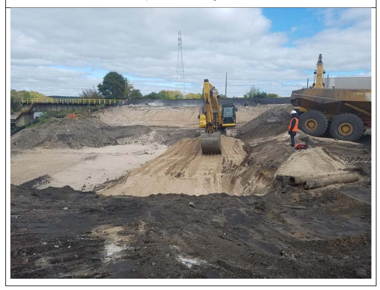
Photo No. 1: Removing overburden material. (photo taken facing east)