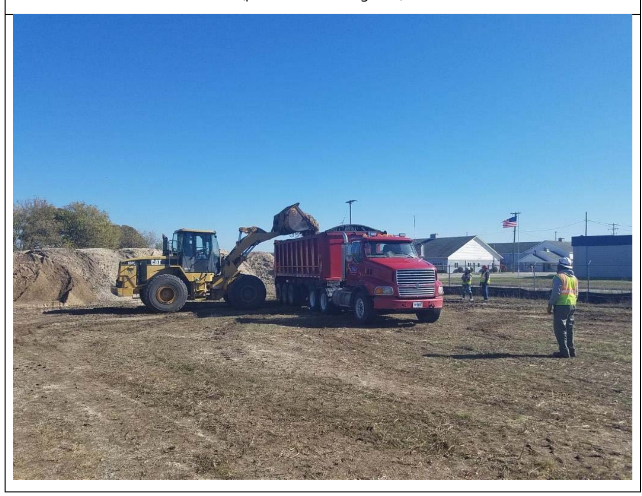
Photo No. 3: Loading soil for disposal offsite. (photo taken facing east)