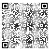
Meijer Graden QR Code