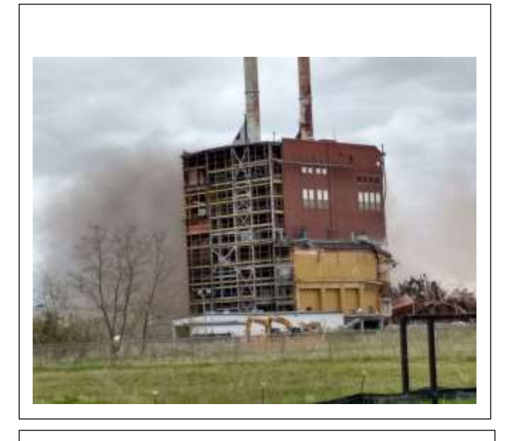
Just after the unit was pulled down. 5/10/19