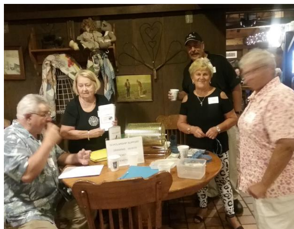
Forerunners officers prepare for the meeting.