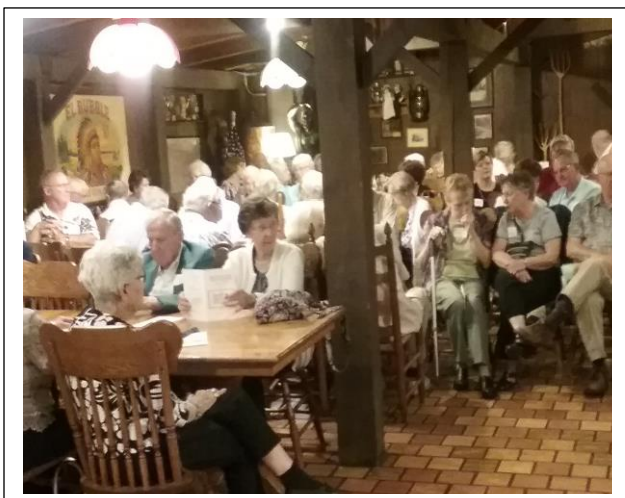
Members gather at Turkeyville