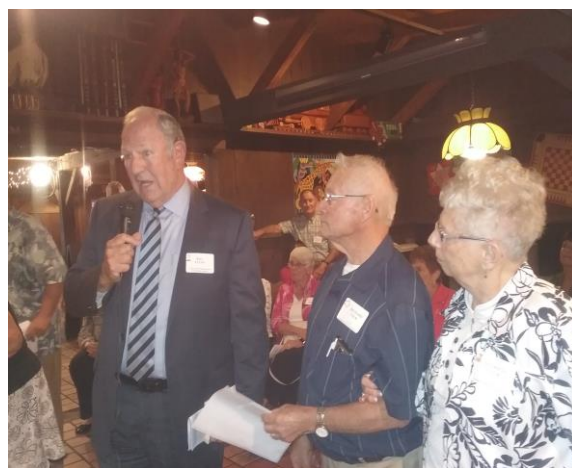
Scholarship recipients (grandparents)