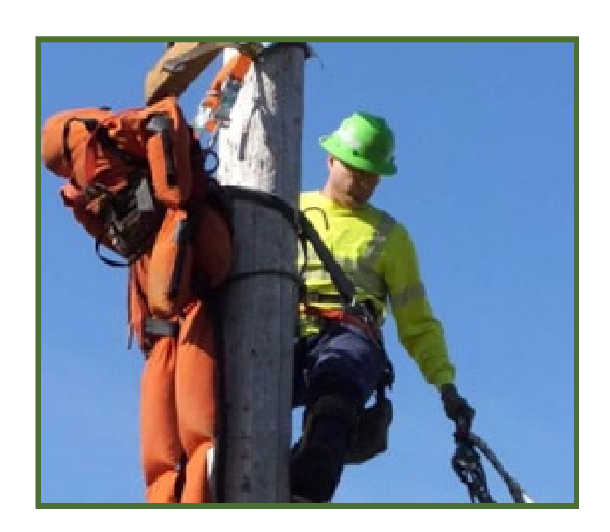
Compiled and designed by Libby Buckland