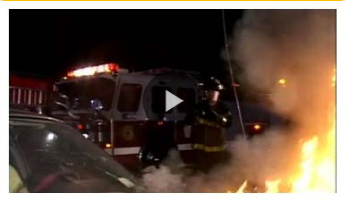
Chapter 6: Energized Vehicle Rescue