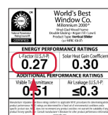
Window Sample NFRC Label