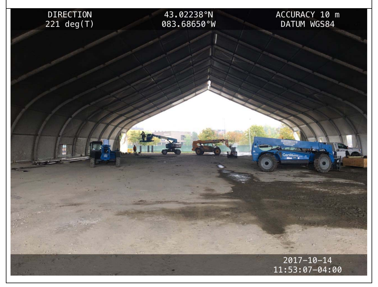
Picture No. 1. Progress deconstructing the material handling structure (photo taken facing southwest).