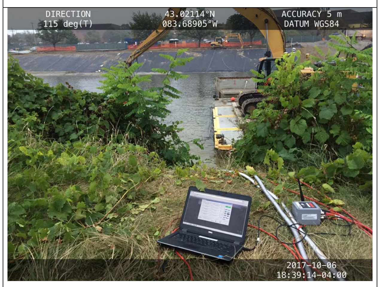
Picture No. 3. Monitoring instrumentation installed in the river (photo taken facing southeast).